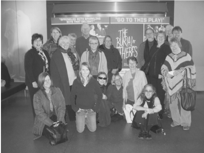
Above: a snapshot of TitW's field trip to The Burial at Thebes . Twenty-two adventurous souls made the trip to the October 29th Guthrie production, with good reviews all around. Watch for announcements of future TitW outings and events.